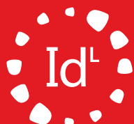
IMAGE DENTAL LABORATORY