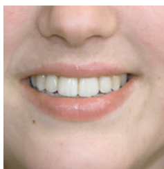
1a) Relaxed Smile