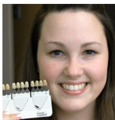
Use The Proper Shade Guide